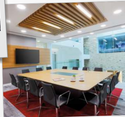
9,000 sq ft Acquisition. St James's SW1.

Kinney Green is an independent firm of Chartered Surveyors specialising in the London Commercial Property Market.