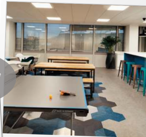
4,000 sq ft Acquisition. Hammersmith W14.