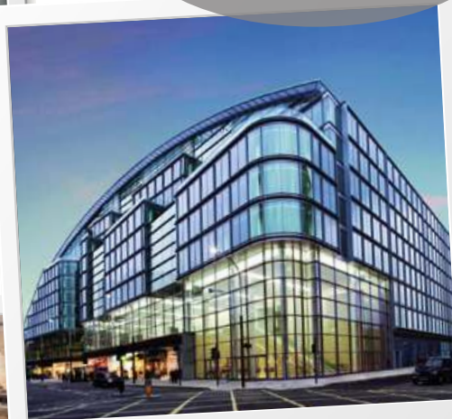
50,000 sq ft Lease Renewal. Victoria SW1.

"Detailed, helpful and studied in your approach, as always. I have huge confidence in both your ability, efficiency and integrity."